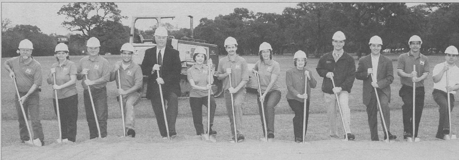
Ground was broken on the new facility on March 10, 2008.

The bond was tabbed to build a new high school and convert the existing school into a junior high for the entire district. All junior high and high school students would have been on the Altair campus if plans had gone through.